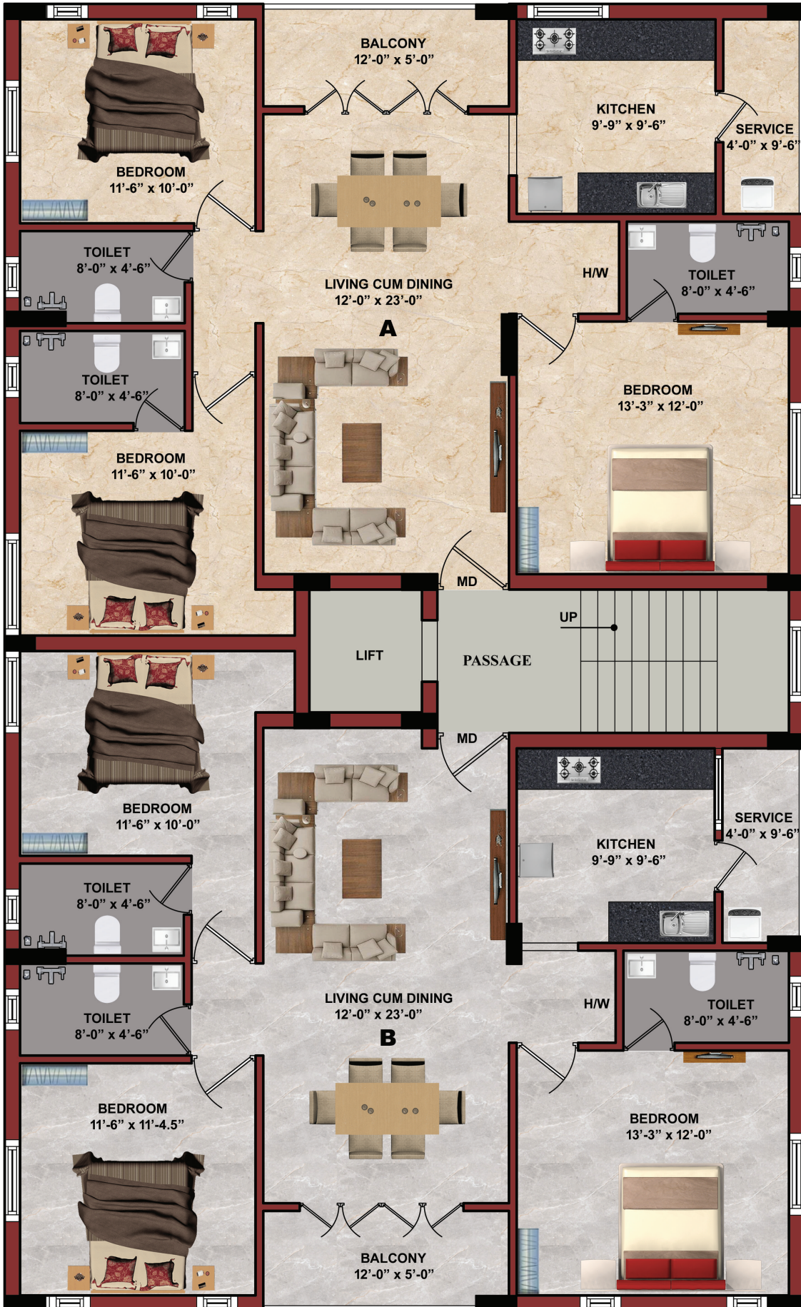
TYPICAL FLOOR PLAN (first,second,third,fourth,fifth floor plan)