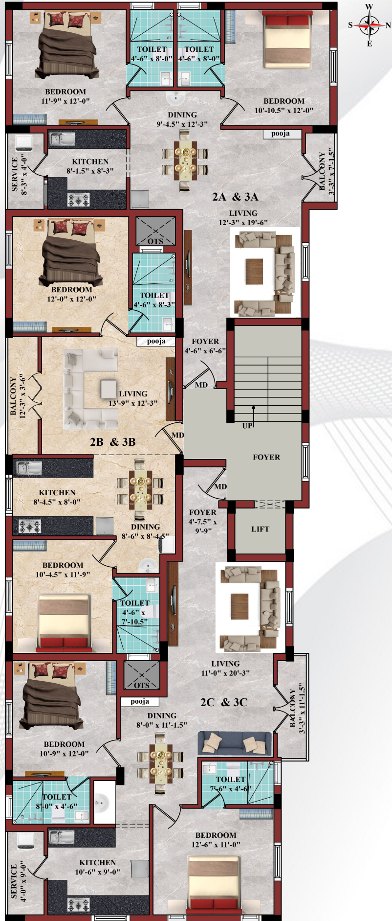
TYPICAL FLOOR PLAN (second and third floor)